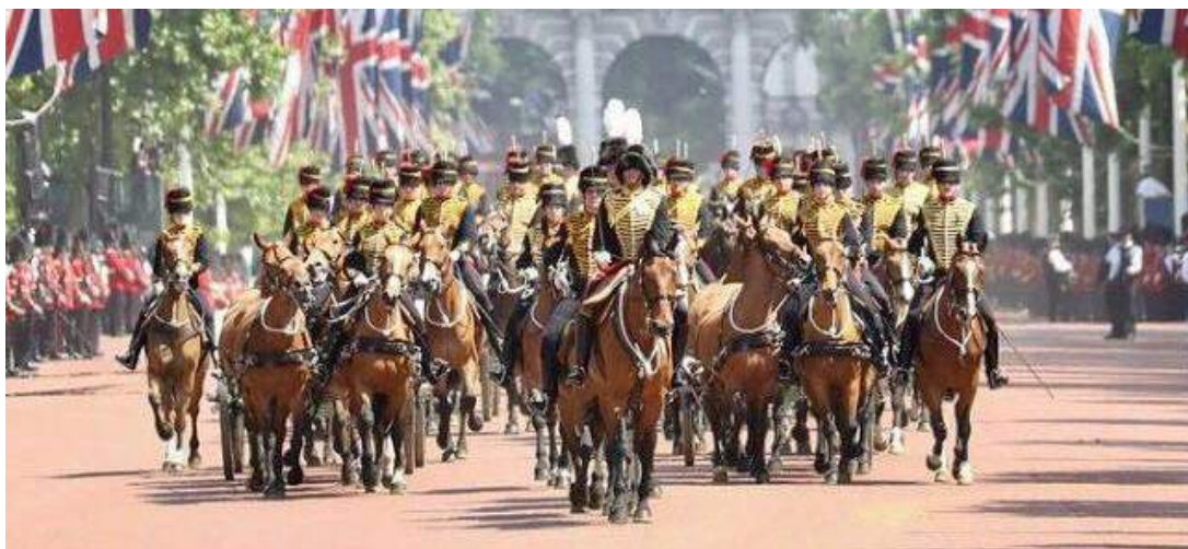
The King's Troop rides along the Mall to Green Park to fire the Royal Salute